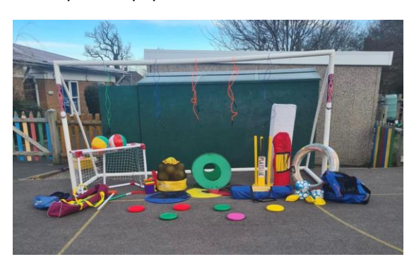
New Sports Equipment £597.35

Whole School PANTO Jack & the Beanstalk £1299.00